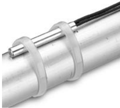
Strap-on Cable Only